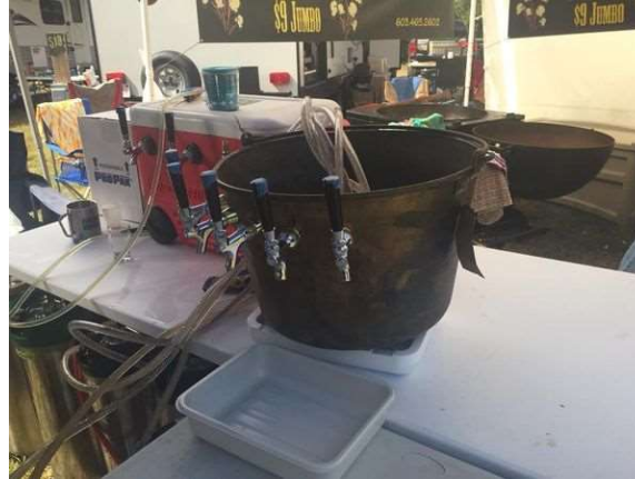
And our new tap system!