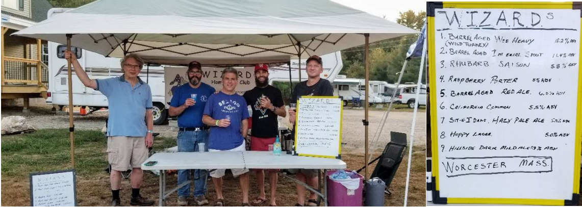
The WIZARDS at the 2021 Jamboree.

Besides the good times, here's what you missed at this year's jamboree, clockwise from our tent, listed by club and number of beverages on offer: