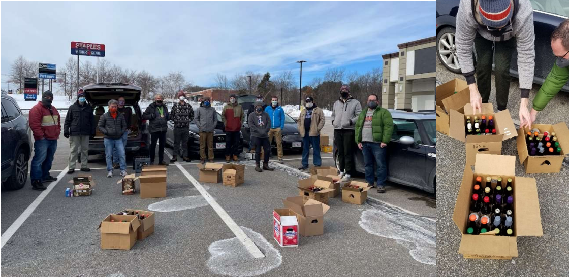
WIZARDS swapping beer in the Bed, Bath & Beyond parking lot.